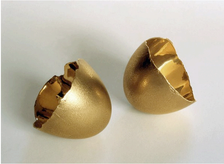
Nothing [II Series 2] , 1969/2004, 18 carat gold cast of a goose egg shell