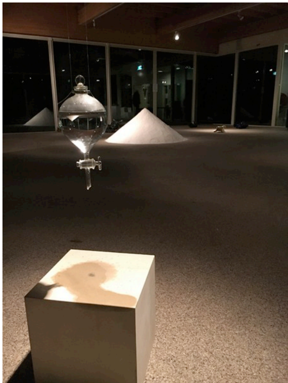
Waterstone, Negative Ions, Spent Bullets