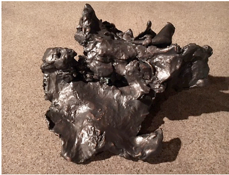
Spent Bullet [Double Bronze] , 2015/2016, bronze plate over ABS resin, 26 ¼ x 26 ¾ x 13 ¼ inches