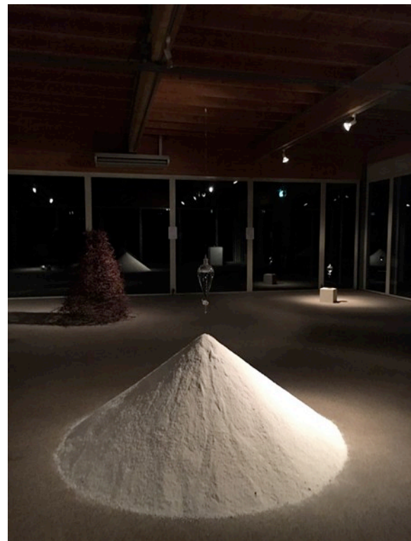
Negative Ions, Home, Waterstone