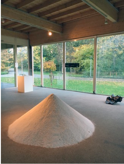
Negative Ions II, Nothing [II Series 2], in vitrine, Medium, Spent Bullet [Double Bronze]