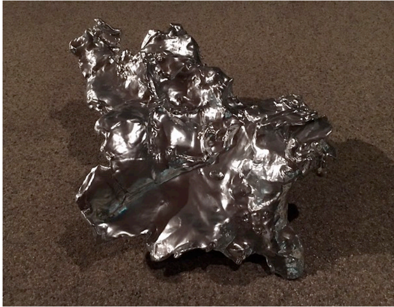
Spent Bullet [Aluminum III], 2015/2016, ABS resin, aluminum paint, 26 1/4 x 26 3/4 x 13 1/4 inches