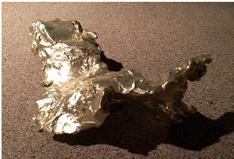
Spent Bullet [Lemon Gold] , 2015/2016, ABS resin, 18 carat lemon gold, 8 1/2 x 23 1/4 x 16 inches