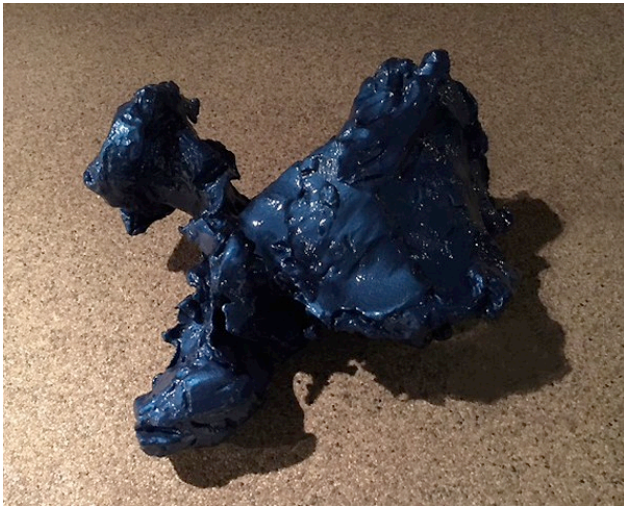
Spent Bullet [Blue Car Paint] , 2015/2016, ABS resin, car paint, 10 1/2 x 26 1/2 x 16 1/4 inches