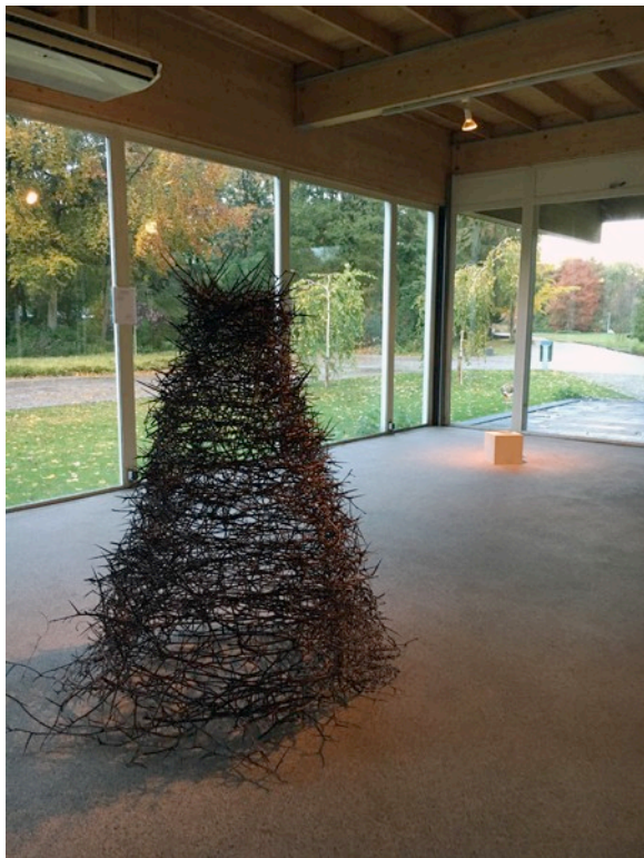
Home , 2008/2016, honey Locust thorns, h:62 inches Waterstone , 1996, limestone, 1000 ml funnel, water