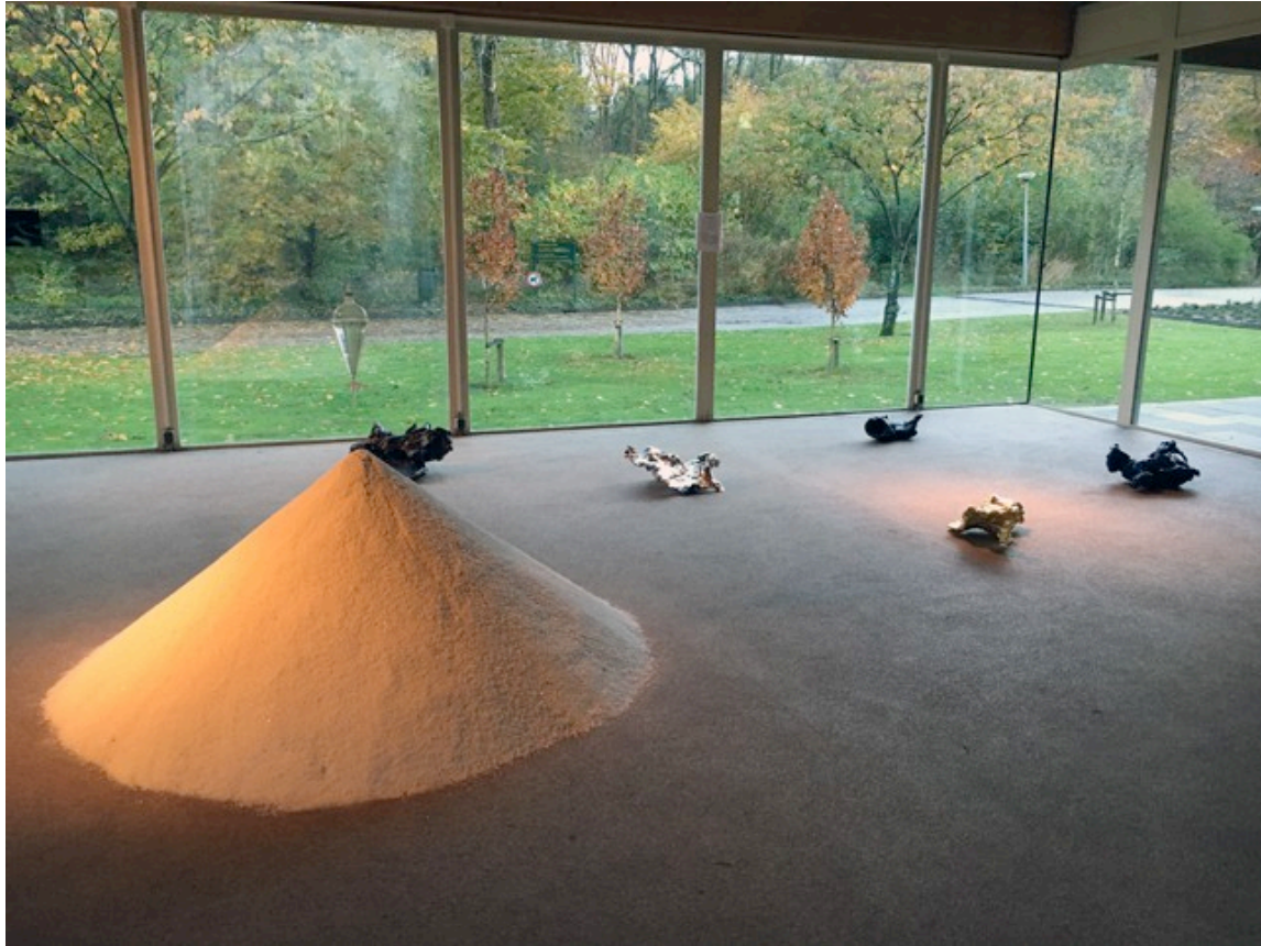
Negative Ions II [salt, separatory, funnel, water], 1996 and Spent Bullets [3D printed .38 caliber bullets], 2015-16

The Glass House, Amstel Park, Amsterdam, 2016