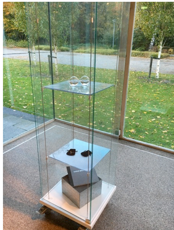
2\sqrt{0} , 1971/1998, Edition of 10, [clock/level] The Mattress Factory , box & first monograph