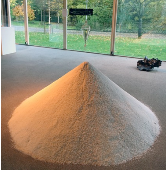
Negative Ions II , 1996, salt, separatory, funnel, water, size: variable Medium , 1992/2009 and Spent Bullet [Double Bronze] , 2015/2016