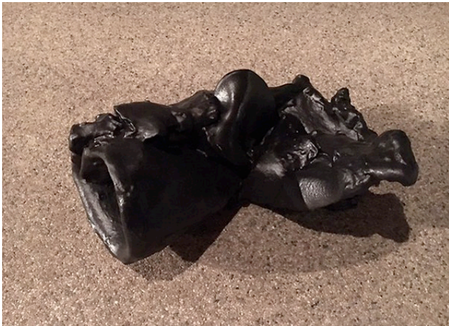
Spent Bullet [Dum Dum II], 2015/2016, ABS resin, rubber, 8 1/4 x 21 1/4 x 8 inches