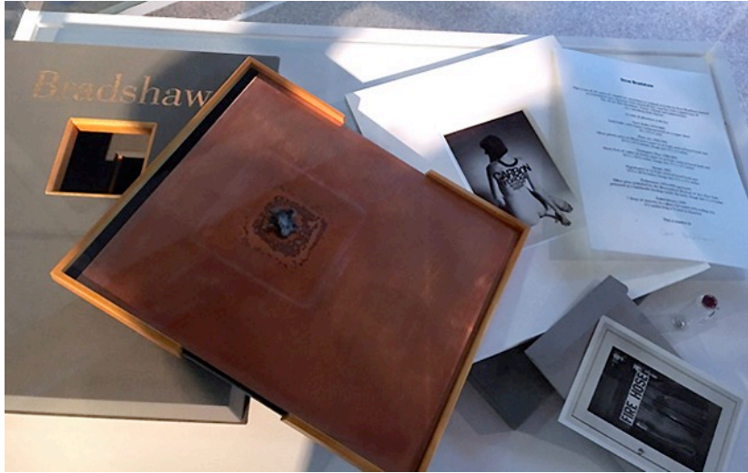
BRADSHAW [LTD Box Book] , 2003, mixed media with 6 works to house second monograph Text: Thomas McEvilley, with reprinting of John Cage and Thomas McEvilley a Conversation, 1992